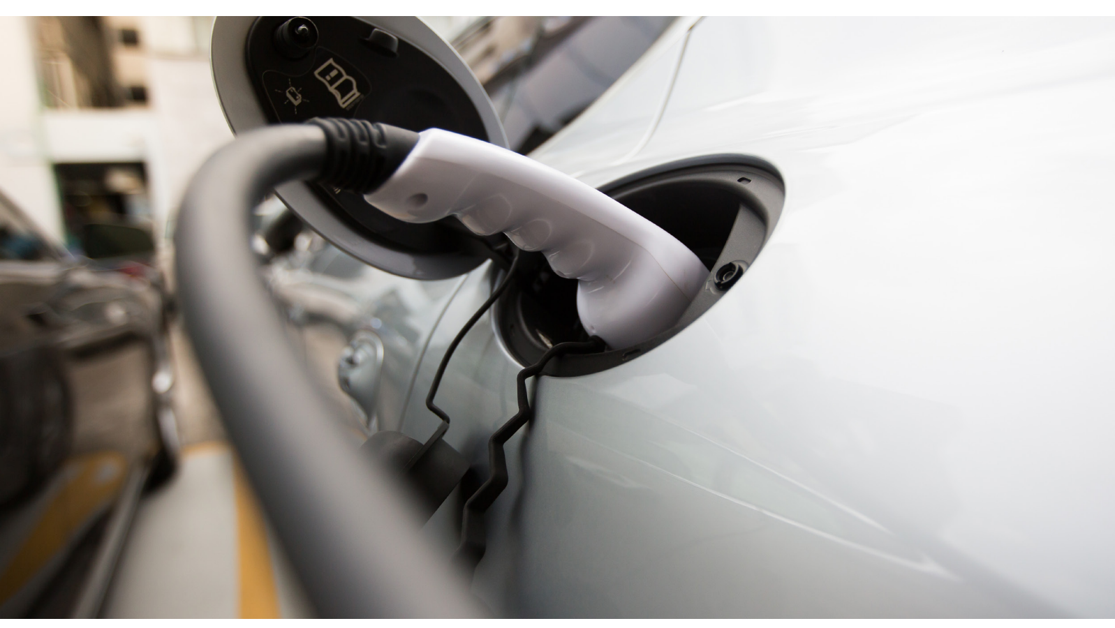
This article was provided by Advanced Energy, a nonprofit energy consulting firm. For more information, visit www.advancedenergy.org.

Over the next few years, electric vehicle growth is expected to continue to rise across the U.S. There are also plans to install thousands of additional charging stations across the country. With the infrastructure in place, people will soon be able to drive electric from coast to coast with plenty of options to plug in along the way.